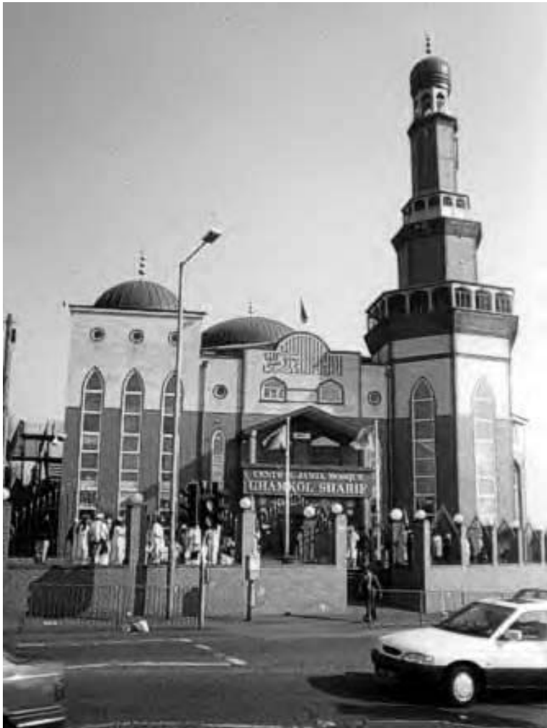
Figure 6. The Dar ul-Uloom Islamia in Small Heath.

of urban planning institutions to represent, and thereafter govern the configuration of urban space. However, as we have also seen, this power is relational to the capacities of different social groups to resist the 'representations of space' made by urban planning. Moreover, the exchanges between the planning authority and the Muslim group with regard to the dome and minaret indicate that these architectural features were invested with considerable social meaning and value – perhaps all the more so for having been contested within the planning process. Examining these interactions thus deepens our perception of the mosque as a meaningful