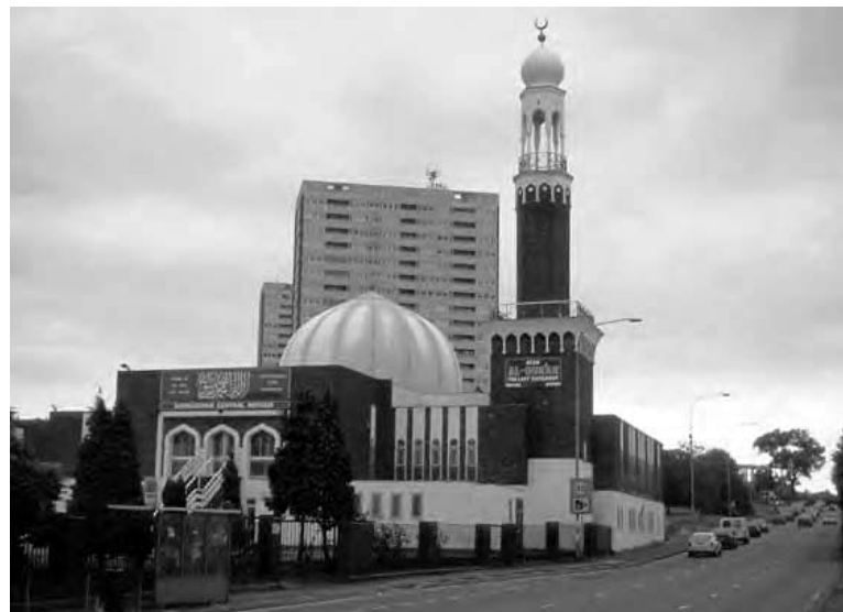
Figure 1. A Landmark for the city: the Birmingham Central Mosque.

Referring to the relationship maintained between Birmingham City Council and the committee of the Birmingham Central