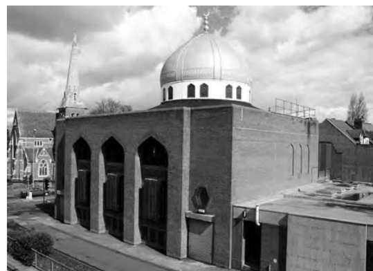
Figure 3. The Jame Masjid in Handsworth, incorporating domes and arched windows that signify mosque architectural traditions.