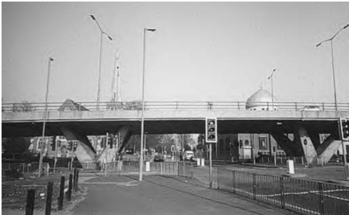
Figure 5. The Jame Masjid 'screened' by an adjacent flyover.

Although many objections have been received from local residents, it is considered that the use of this site as a mosque would be appropriate.